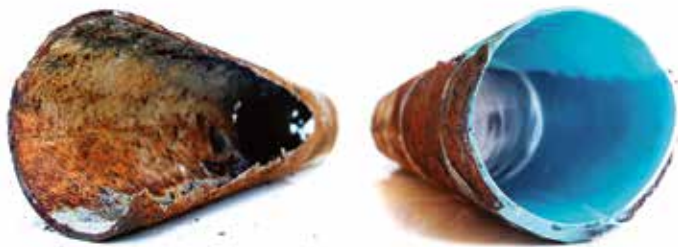
Pipe before and after Nu Drain treatment.

Pipe lining begins with mapping the internal plumbing system and getting a camera inspection of drain and sewer pipes. A project schedule and cohesive plan are created to minimize disruption and maximize customer satisfaction. The pipes are tested for leaks and then thoroughly cleaned. Existing access points are used to insert a pipe lining solution. Nu Flow's patented Nu Drain system, which is used to rehabilitate drain, waste, sewer, and vent pipes up to 12" in diameter, uses a Pull-in-Place process where an epoxy-saturated felt liner is pulled and/or pushed into the host pipe. An internal bladder