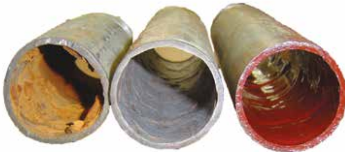
Pipe before cleaning, after cleaning, and after lining with Nu Line.